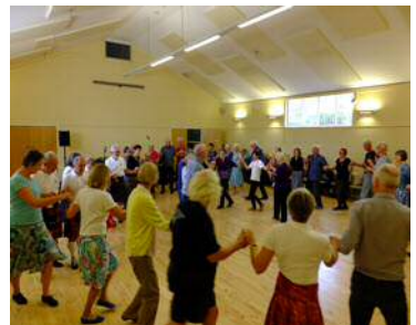
Stepping in a circle with the Balkan dance group