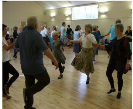
A dance from the Berkhamsted Strathspey and Reel Club.