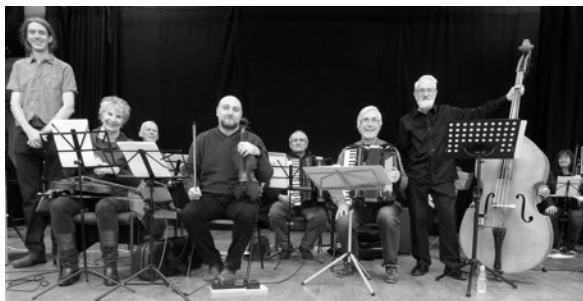
Musicians from music workshop playing for the evening dance