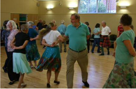
Getting to grips with the allemand swing