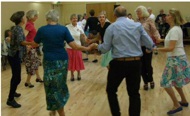
The Duke of Wellington's Quadrille